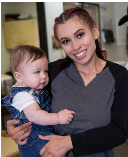
Photo: A Head Start parent from Oakland, California with her child.

"My daughter attends Head Start on the Indian Reservation. My husband and I work full-time, so we are not able to be with our children like we want to. We really appreciate the Head Start program. As a parent, I feel comfortable leaving my child with the teachers all day. My daughter loves to go to school every day and when she gets home, she immediately starts talking about what she learned."