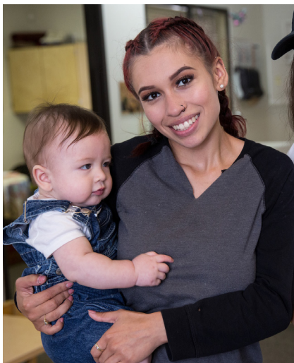
Photo: A Head Start parent from Oakland, California with her child.

"I am a young single parent. I had my child at 19 years old. His father ran out during the pregnancy. After I had my son and he got to start at Early Head Start, it made my life better. I don't know how I would have been able to work and go to school without EHS. I would not be able to pay for day care while trying to just make a living for me and my son."