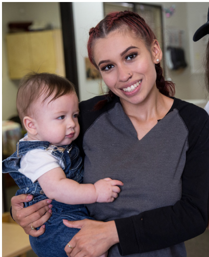
Photo: A Head Start parent from Oakland, California with her child.

"When I found Head Start, I was a high school dropout with a ninth grade education and working 60 plus hours in the gas station barely making ends meet. My Family Service Advocate asked me if I had any goals for my son or family, I said I wanted to get my GED. She told me about a grant they received to help parents go back to school and I did it. I received my GED and then a BA."